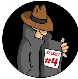
Resume Secret #4